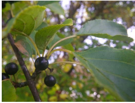
alder-leaved buckthorn Rhamnus alnifolia oval leaf, fine teeth; red to purple-black in leaf axils, long stalks, often hidden by leaf; not edible, toxic