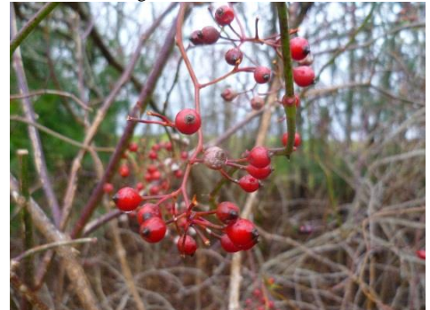
multiflora rose Rosa multiflora pinnate leaf, oval leaflets, distinctive teeth; 5 mm orange to red hips, hairless, retaining only the crown of the old calyx; See above.