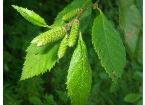
yellow birch Betula alleghaniensis heart-shaped base, broken twigs wintergreen smell, double tooth; green cones dry to brown cones, methyl salicylate; above ^

REFERENCES: Blouin 2012; Boland 2012, Dwelley 1980; Little (Audubon) 1980; MacKinnon 2009; Petrides (Peterson) 1988; Tully 2021, Whiston 2019; Wojtech 2011;