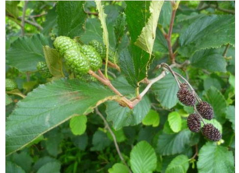
speckled alder Alnus incana egg-shaped leaf, rough, wrinkled, pleated, deep straight sunken veins, doubled tooth; green cones short stalks, dry to brown cones; some song birds, siskins, chickadee, goldfinch, redpolls, nuthatch, ruffed grouse