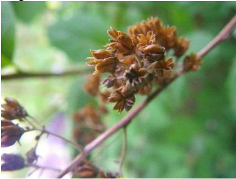
meadowsweet Spiraea latifolia oval – lance leaf, coarse teeth; pyramidal clusters of small star-like capsules, salicylic acid; sparrows