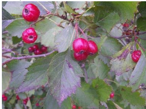
hawthorn Crataegus 7 + lobes, sharp irregular teeth; small clusters red pome, with partially remaining calyx; edible; cedar waxwing, robin, pine grosbeak, game birds, small animals