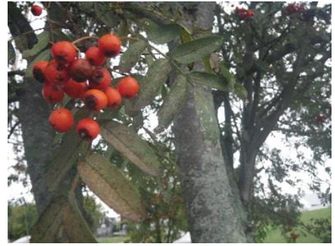
northern mountain ash / showy mountain ash / dogberry Sorbus decora pinnate leaf, lance leaflet, stalkless, round near pt. tip, fine teeth; clusters larger orange- red pomes, partially remain calyx, parascorbic acid, bitter, somewhat toxic; songbirds, cedar waxwing, grosbeaks, robins, ruffed grouse, fisher, marten, bear