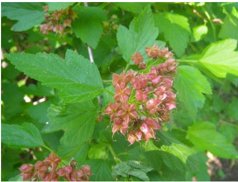
eastern ninebark / common ninebark Physocarpus opulifolius 3 lobes, rounded teeth; rounded clusters pink-red; many birds