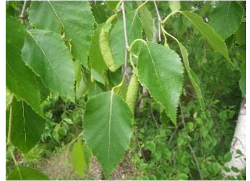
white birch Betula papyrifera egg-shaped, thick, rounded base, long pointed, irregular teeth; green cones dry to brown cones; above ^