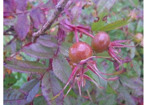
Virginia rose / pasture rose Rosa virginiana pinnate leaf, elliptical leaflets, thin, shiny, top ¼ of leaf teeth; red hips with some bristles, calyx falls leaving a crown, made into jelly; finches, waxwing, thrushes, blackbirds, wild game, small mammals