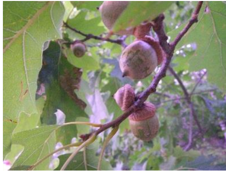
northern red oak Quercus rubra 7 lobe, yellow or red ribs, shallow wide sinuses, pointed tips; relatively stout acorn, flat cap, its tannin repels animals, bitter, rinse to leech out tannins; herbivorous birds, mourning dove, ruffed grouse, bobwhite, wood duck, turkey, pheasant, chipmunk, squirrel, fox, raccoon, deer, bear