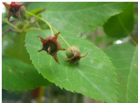
serviceberry / shadbush / Juneberry / Indian pear / Saskatoon Amelanchier oval to elliptical leaf; fine teeth; long stem, green > red > black-purple pome, enduring calyx crown; sweet mealy; song birds, chickadee, hermit thrush, robins, catbirds, blue jay, woodpecker, mourning dove, game birds, squirrel, martin, bears