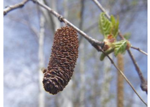
gray birch Betula populifolia triangular leaf, lustrous, flat base, tapering tip, coarse teeth; grows in sterile soil; green cones dry to brown cones; above ^