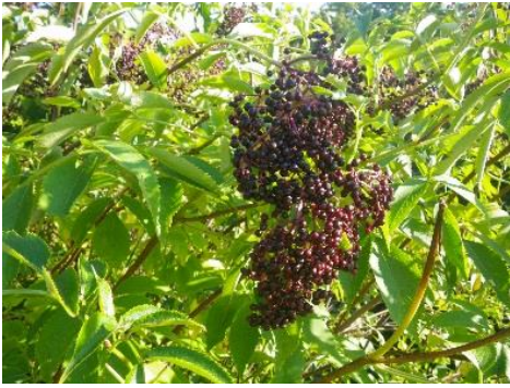
common elderberry Sambucus canadensis pinnate leaf, elliptical leaflets, glycosides, finely toothed; very thick clusters red > purple-black, pulpy, small drupes; hydrocyanic acid, edible, seeds toxic; 43 birds, robin, nuthatches, eastern phoebes, catbird, kingbirds, mourning dove, pheasant, ruffed grouse, wild turkey.