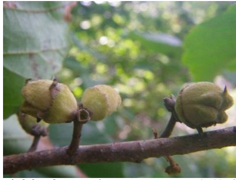
witch-hazel Hamamelis virginiana asymmetrical leaf, rough, undulating edge, prominent veins, rounded uneven teeth; 4 pointed capsule, furry green > drying, woody & brown, when splits ejects black seeds; bobwhite, pheasant, ruffed grouse, rabbit, beaver, deer