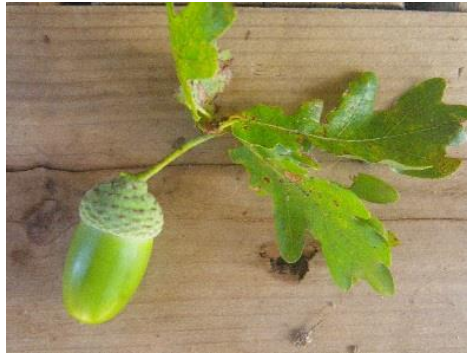
English oak Quercus robur 7 lobes, short stalked, deeper lobes than swamp white oak, rounded tips; long stalk, long acorn, half round cap; See above for birds & animals.