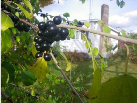
European buckthorn Rhamnus cathartica oval – elliptical leaf, curving veins, wavy fine teeth; [twigs often thorn tipped], shiny black cluster base of twigs, mildly toxic