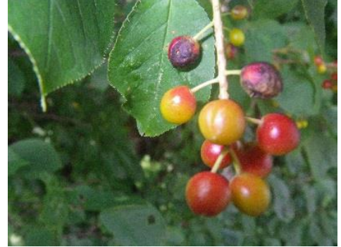
black chokeberry Aronia melanocarpa elliptical leaf, spoon-shape, some abruptly taper, fine teeth; hanging stalked clusters red > black pomes, juicy, very bitter