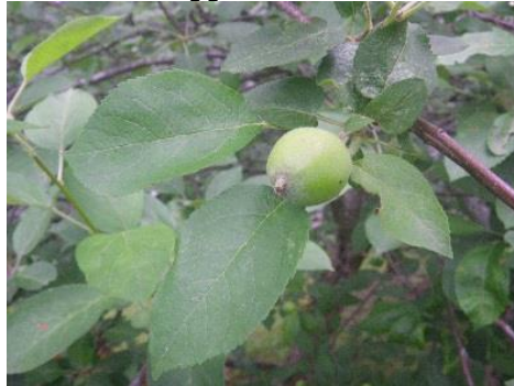
wild apple Malus pumila elliptical or round leaf, rough, wavy, small teeth; thick stemmed, green > red pome; edible; grouse, deer, all kinds of wildlife