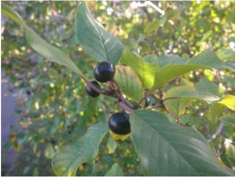
glossy / smooth buckthorn Frangula alnus elliptical leaf, shiny dark green, smooth edge; red > black in leaf axils; mildly toxic; starlings, over wintering birds,