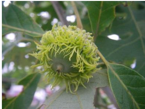
burr / mossy-cup oak Quercus macrocarpa 7 lobe leaf, shiny, dark green, wide deep sinus, rnd tips; deep fringed cap, edible; see above for birds & animals.