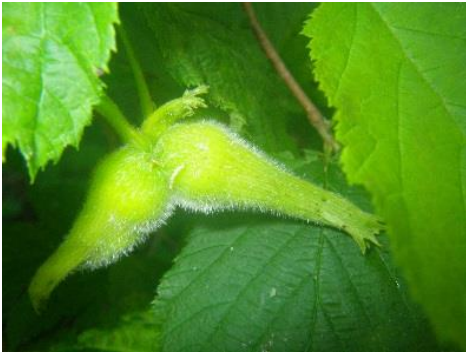
beaked hazelnut Corylus cornuta egg-shaped leaf, may have heart shape base, abruptly taper, veins to longest of double teeth; hairy green husk enclosing nut, edible, high protein, low carbohydrates; blue jay, small rodents, deer. Chipmunks and squirrels store them,