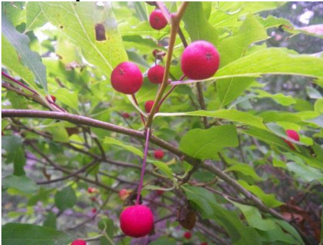
mountain holly Ilex mucronatus elliptical leaf, light green, stalked, sharp tipped, smooth edge; long stemmed light red drupes; [The author had difficulty finding this plant and eventually found it close by. About two years later, the area & plant were clearcut.]